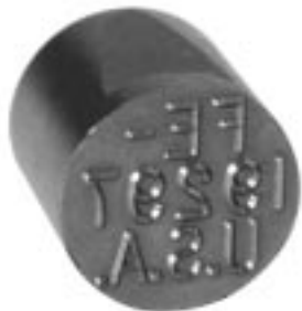
Die Insert Stamp

Trademarks, trade names, patent numbers or lettering of any important data are accurately engraved on special alloy tool steels and properly hardened to give maximum wear life.