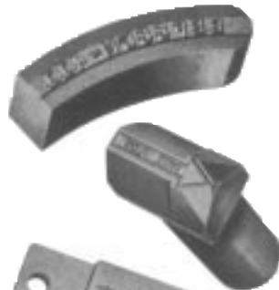
Press Mounted Stamps